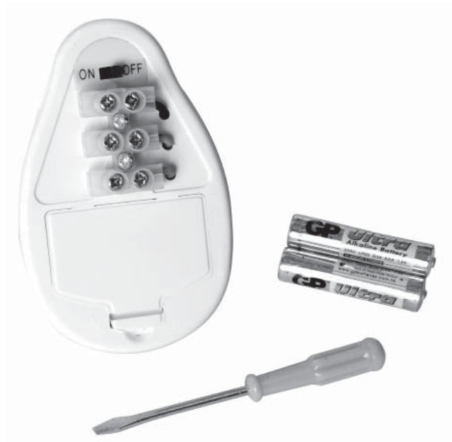
Detail 1. Back of the FloorWarner, battery and screw driver supplied with order.