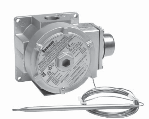
Detail 1. OTS-3A.