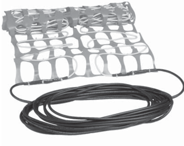
Slab Snow Melting Mats

Mats are available in a variety of widths and lengths. A wide range of voltages can also be specified.