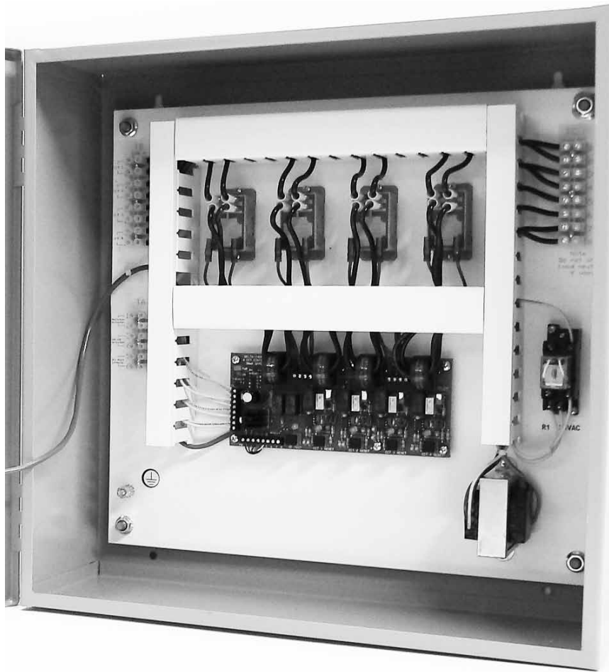
Detail 1. Inside of a 4-circuit panel