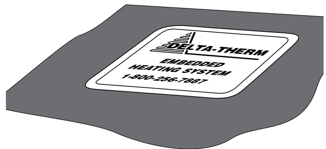
Detail 3. Level with surface.