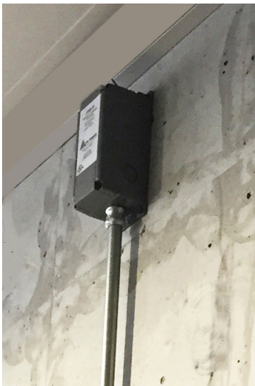
2. The thermostat is connected to the ground fault relay panel in the utility room on the other side of the wall. Capillary bulb not shown.

The entire system is controlled with a single ambient thermostat to activate all heat trace cable in the top floor of the garage at 40°F. The OTS-F1 thermostat is connected through conduit to a 4-circuit GFPE panel mounted on the other side of the concrete garage wall. There, in the utility room, the GFPE relay panel provides code-required 30mA ground fault protection without the need for modifications to the Power Distribution Panel.