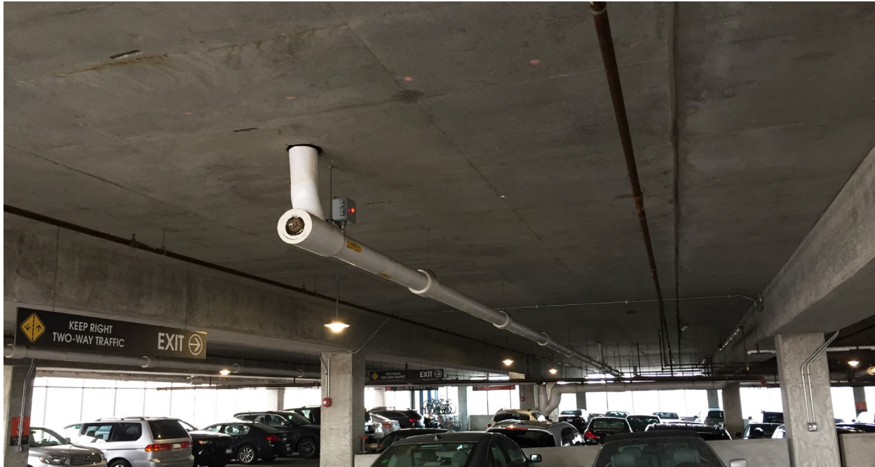
1. Beneath the insulation, drain pipes are traced with electric heating cable and wired to a sensor that activates the system automatically when the temperature drops below 40°F.