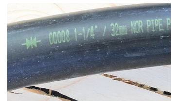
1 1/4" ID